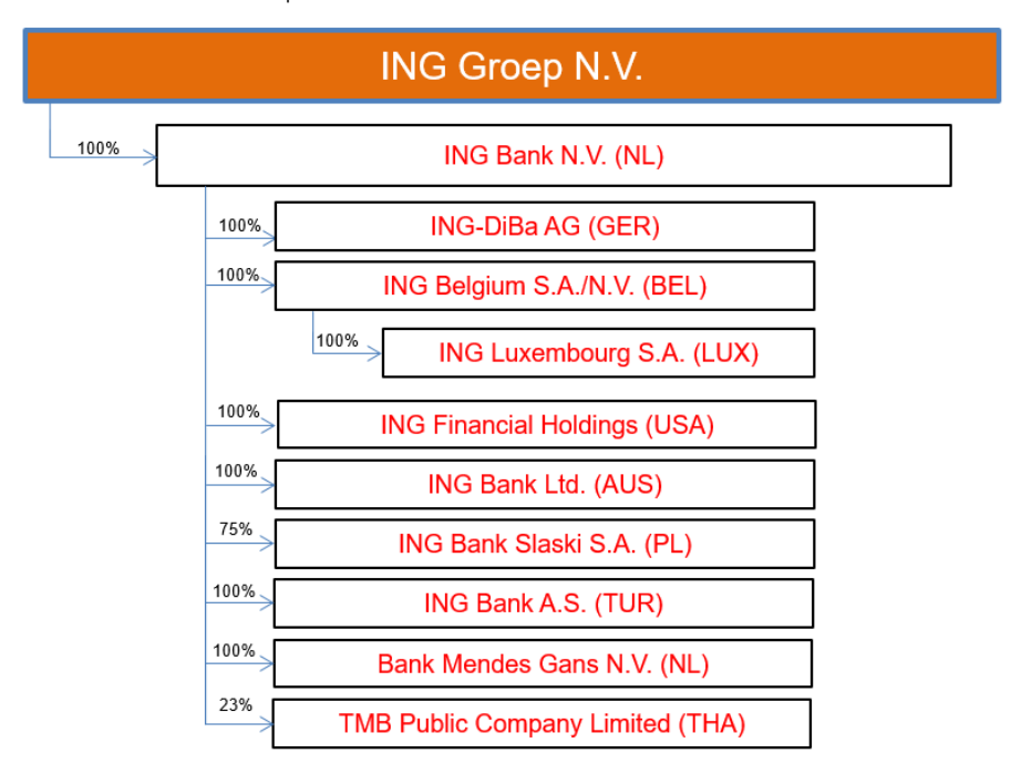
Chart 1: Principal subsidiaries, investments in associates and joint ventures of the ING Groep N.V.

Considering ING's development in the structure of the Group in recent years, there was only one major change. In July 2019, ING completed the sale of ING Lease Italy with the settlement price of about €1.1 billion.